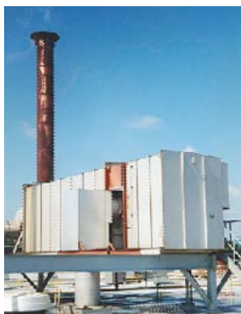
Recuperative Thermal Oxidizer